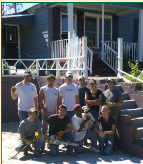
Alabama Alpha brothers work with the Boys & Girls Club of Tuscaloosa after the tornado.

Alabama Alpha Becomes Beacon of Hope for Community Through Donations and Service