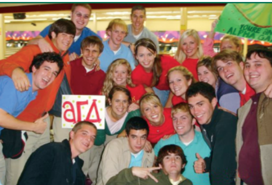
Members of Alpha Gamma Delta and Phi Kappa Psi pose for a Homecoming photo.