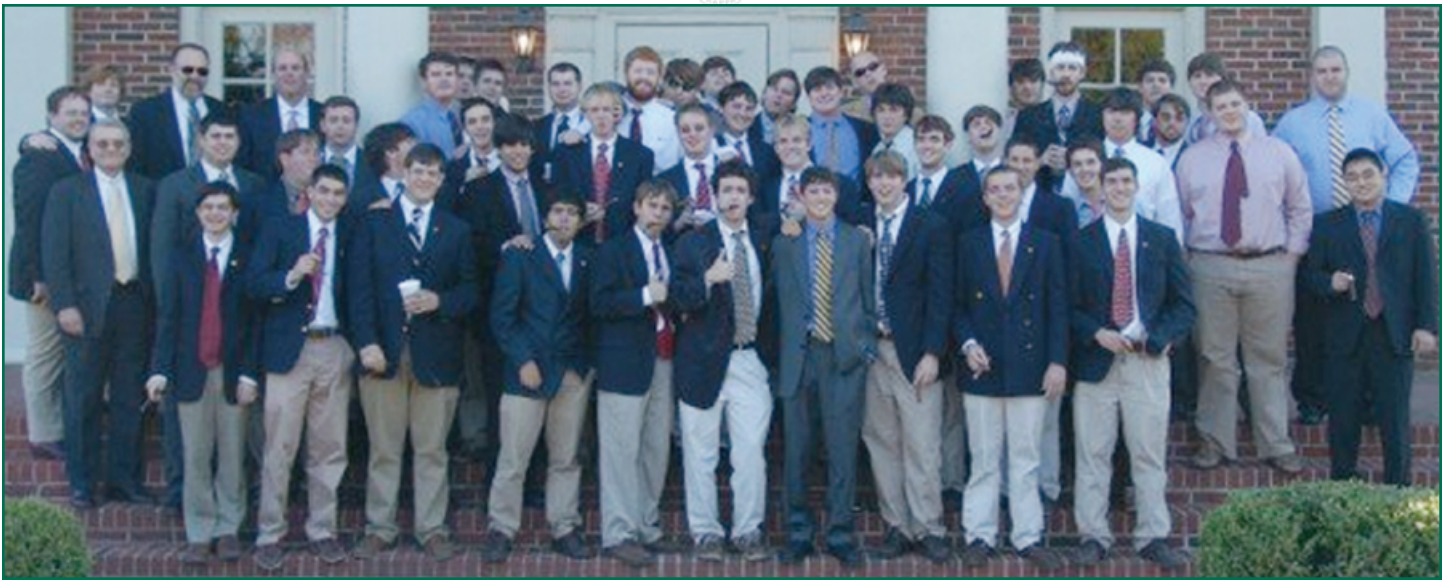
The Alabama Alpha Chapter gathers for a group photo after initiation.